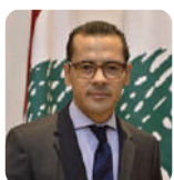
MP. FADI ALAME PRESIDENT ARAB HOSPITALS FEDERATION