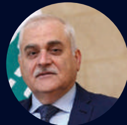
HE. DR. JAMIL JABAK FORMER MINISTER OF PUBLIC HEALTH - LEBANON